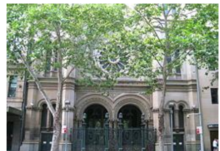
The Great Synagogue front entrance in Elizabeth Street, opposite Hyde Park.